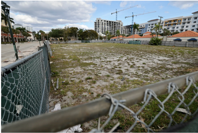
An empty lot that could become a 42-unit multifamily project called the Concierge is shown in Boca Raton on Monday, April 8, 2024.