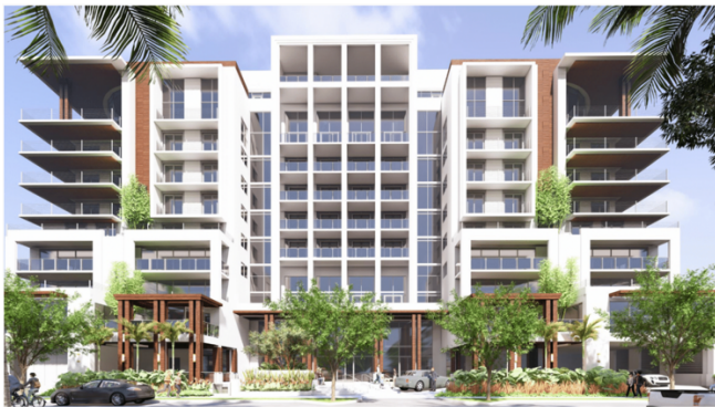
A rendering depicts the Concierge, a 42-unit multifamily high-end condo project that could come to Boca Raton.

The project would rise nine stories and feature 74 parking spots, including 60 valet-only parking spots.