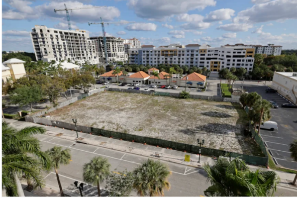
An empty lot that could become a 42-unit multifamily project called the Concierge is shown in Boca Raton on Monday, April 8, 2024.